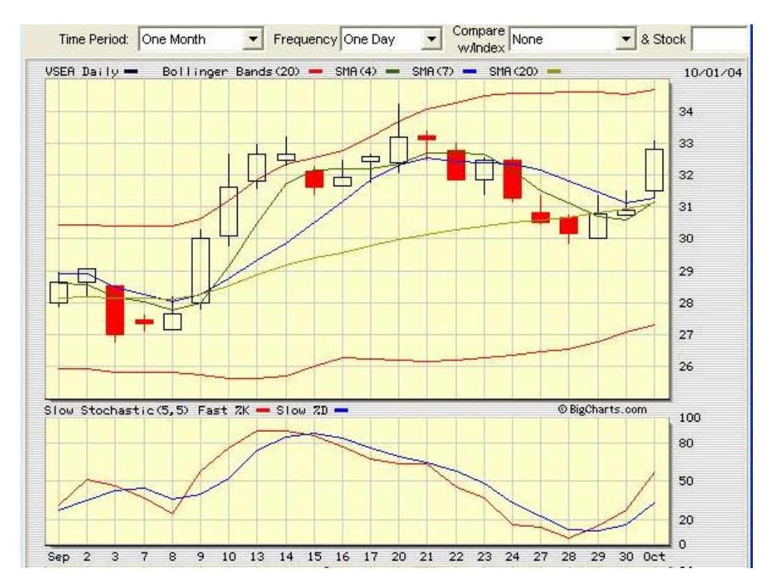
Figure 2. Stochastics for VSEA 1 month daily chart

down trend. We want to look for %K and %D to be rising above 20 but below 80. Ideally we want to see both indicators moving in the same direction. This confirms a positive uptrend. There are slow and fast stochastics, both use 2 parameters. There is also full stochastics which uses 3. We will opt for full stochastics with a setting of 6 5 5. This setting is a little smoother than default settings. If the available chart does not have full stochastics we will use slow stochastics with a setting of 6 5. Fast stochastics whipsaw and give too many false signals.