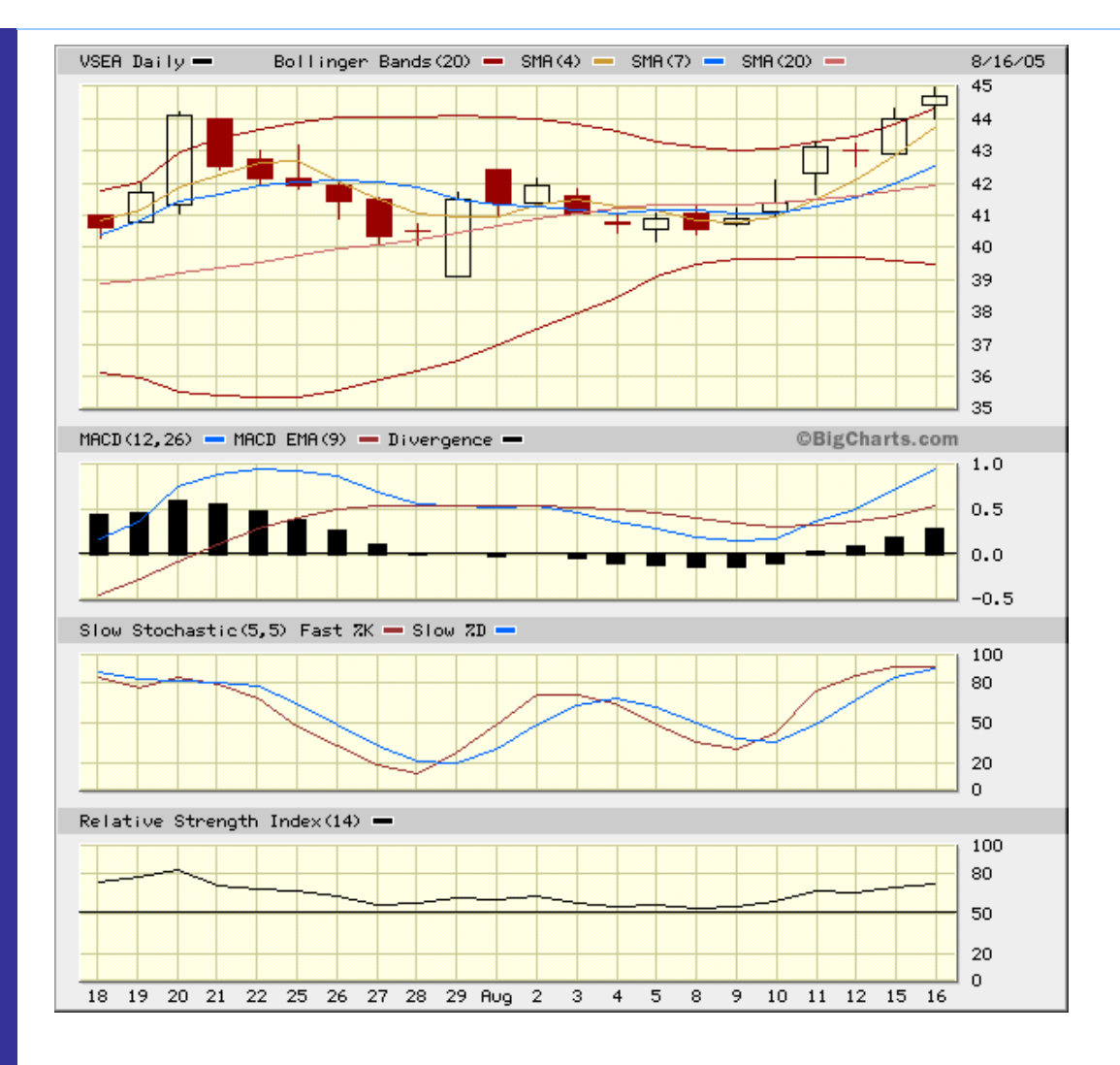
Figure 3. RSI for VSEA 1 month daily chart

On August 10<sup>th</sup> you can see as RSI rises from 30, the stock price rises as well. A steady uptrend within this range would be a confirming signal.